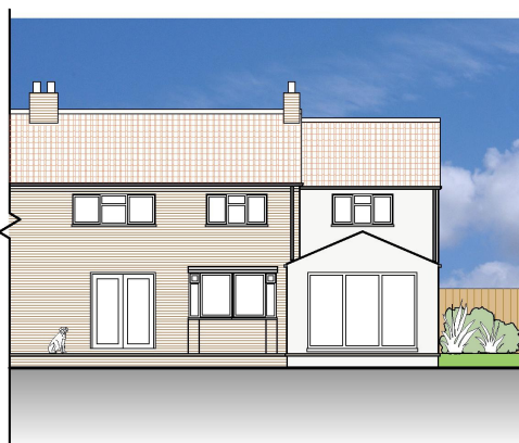
PROPOSED REAR (SOUTH) ELEVATION