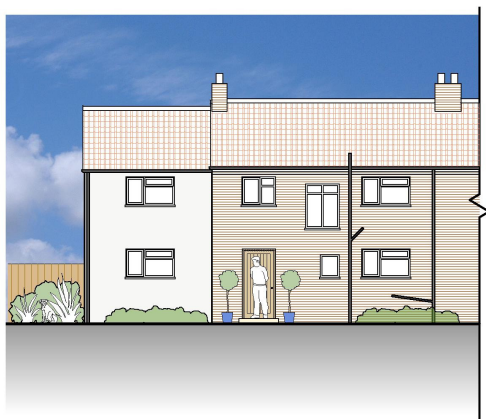
PROPOSED FRONT (NORTH) ELEVATION